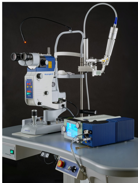
The Merilas 532 \alpha in combination with the MICRORUPTOR 6 makes a combination unit with the most ergonomical Nd:YAG laser available.

Available upon enquiry, MERIDIAN is partner of HAAG-STREIT INTERNATIONAL